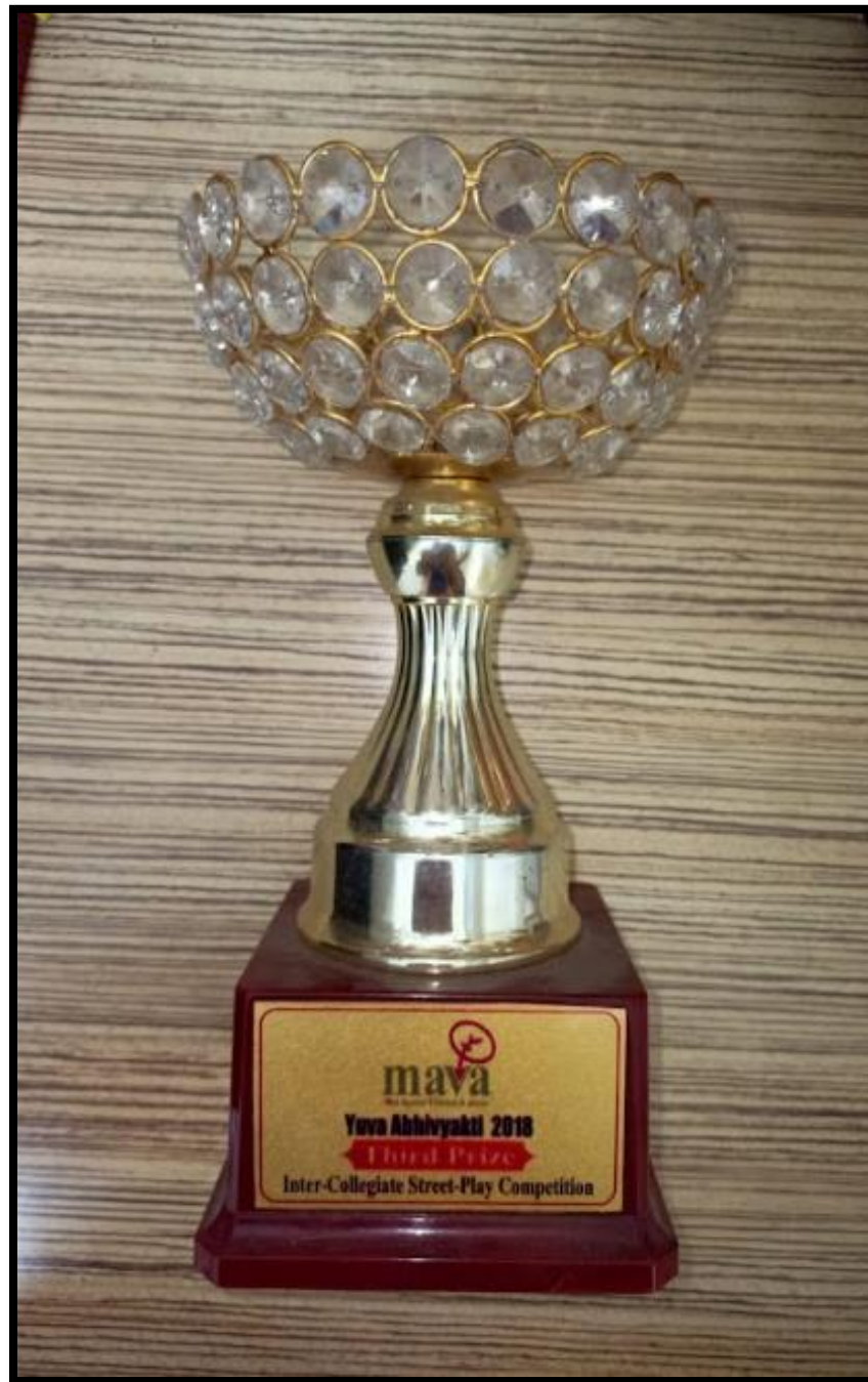
3rd Prize in street play MAVA NGO