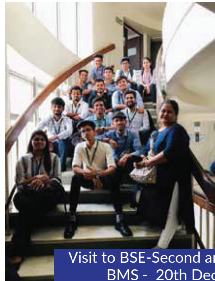
Visit to BSE-Second and Third year BMS - 20th December 2020