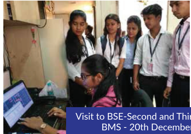
Visit to BSE-Second and Third year BMS - 20th December 2020