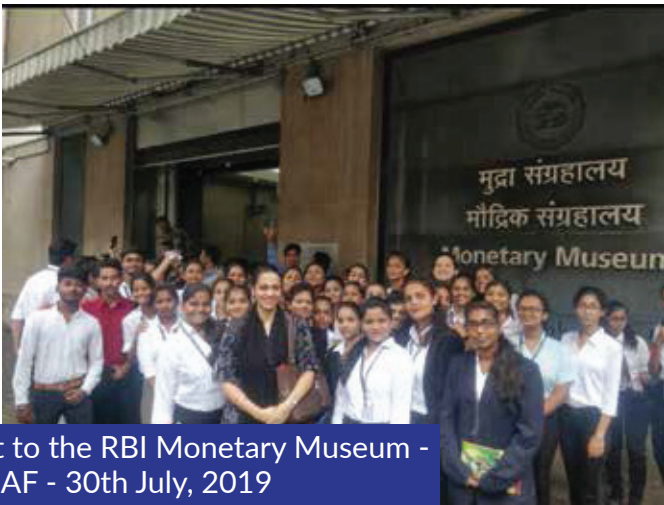
Visit to the RBI Monetary Museum - FYBAF - 30th July, 2019