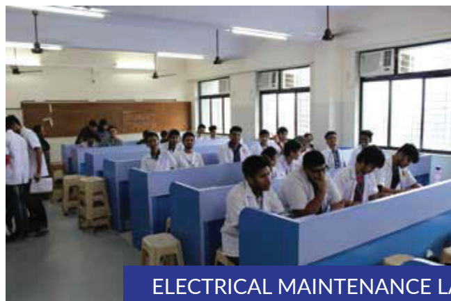
ELECTRICAL MAINTENANCE LAB