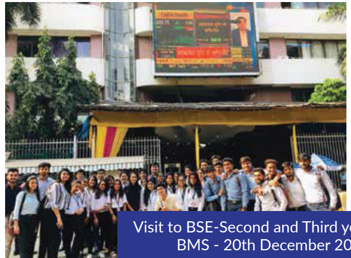
Visit to BSE-Second and Third year BMS - 20th December 2020