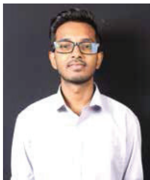
VARTIK PASI CAPEGEMINI TECHNOLOGIES INDIA LIMITED