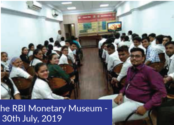
Visit to the RBI Monetary Museum - FYBAF - 30th July, 2019