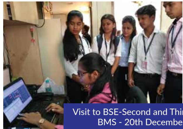
Visit to BSE-Second and Third year BMS - 20th December 2020