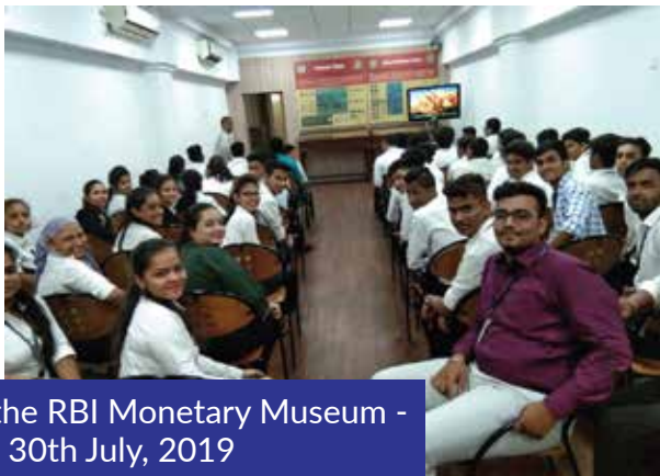
Visit to the RBI Monetary Museum - FYBAF - 30th July, 2019