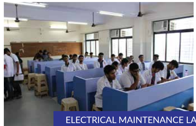
ELECTRICAL MAINTENANCE LAB