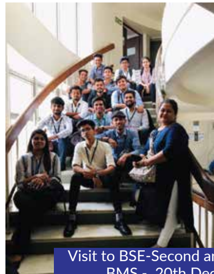
Visit to BSE-Second and Third year BMS - 20th December 2020