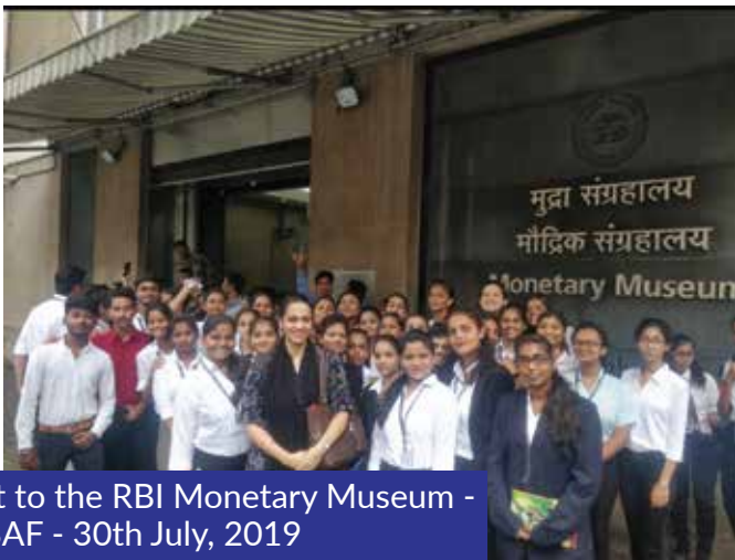
Visit to the RBI Monetary Museum - FYBAF - 30th July, 2019