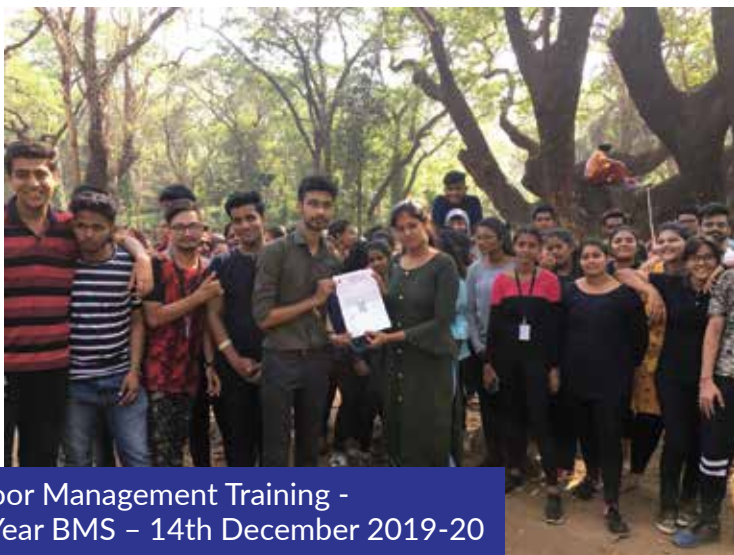
Outdoor Management Training - First Year BMS - 14th December 2019-20