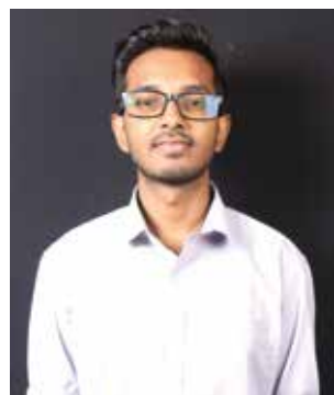
VARTIK PASI CAPEGEMINI TECHNOLOGIES INDIA LIMITED