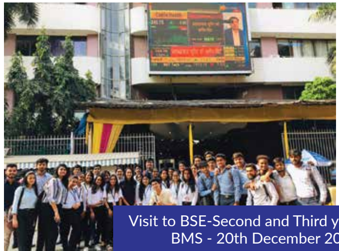
Visit to BSE-Second and Third year BMS - 20th December 2020